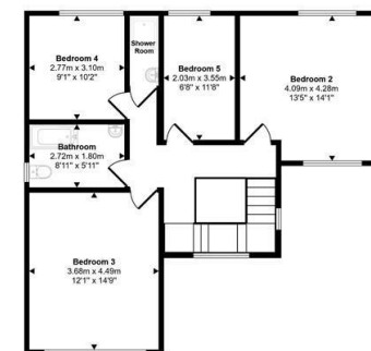
First Floor Approx 72 sq m / 775 sq ft

This floorplan is only for illustrative purposes and is not to scale. Measurements of rooms, doors, windows, and any items are approximate and no responsibility is taken for any error, omission or mis-statement. Some of the items such as bathroom suites are representations only and may not look like the real items. Made with Made Simple 360.