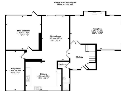
Ground Floor Approx 119 sq m / 1277 sq ft